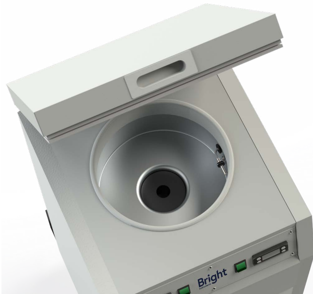
The lower chamber is pictured here containing the aluminium block for quick freezing.

A seven day timer can be fitted to the Clini-RF and is available as an accessory. This means that during the hours when the Clini-RF is not being used it can be run in a 'standby' mode with both the upper and lower chambers running at -40^{\circ}\text{C} , thus saving power. At the start of the working day it can be switched to its normal operating mode and the lower chamber can be brought down to -80^{\circ}\text{C} .